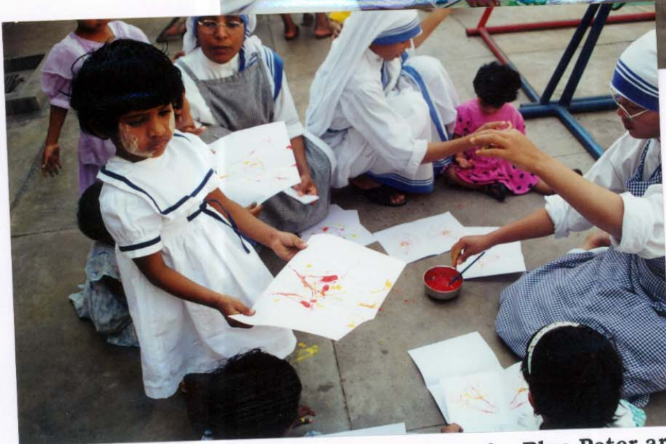
Thus the photo opportunities for Blue Peter are limitless and the benefit it can do to countless tiny lives is inestimable