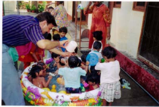
Out door activity included playing in the garden with plants and flowers play with pets like rabbits and cats - Oke?