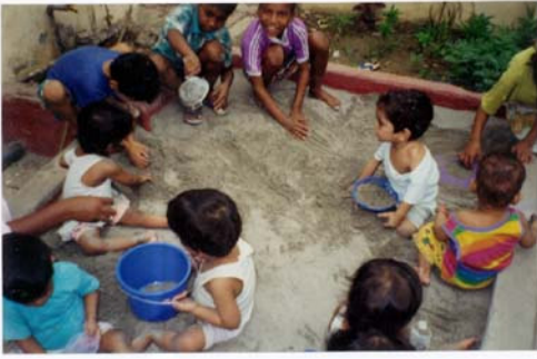
There was fun in the sand pit.